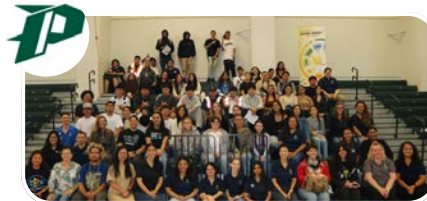
Pāhoā High School Reality Fair | January 23

At the end, students reviewed their budgets to see whether they stayed on track or went into debt, gaining practical insight into real-world money management.