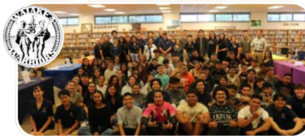
Waiākea High School Reality Fair | March 27